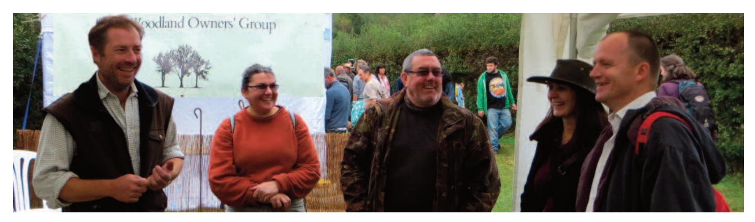
SWOG exists to support woodland owners and to share knowledge of trees and woodlands with anyone who is interested. We do this in several ways.