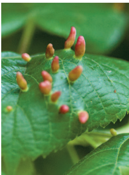
Galls on a lime leaf.

Sadly, there is no sign that the various pests and diseases that afflict British trees are going away, but we can all keep them under surveillance and help to control them.