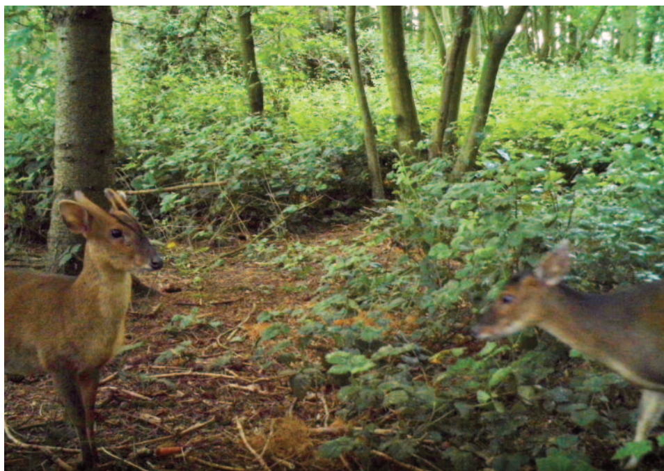
The pictures of the badger and muntjac deer were all taken with John's trail camera.