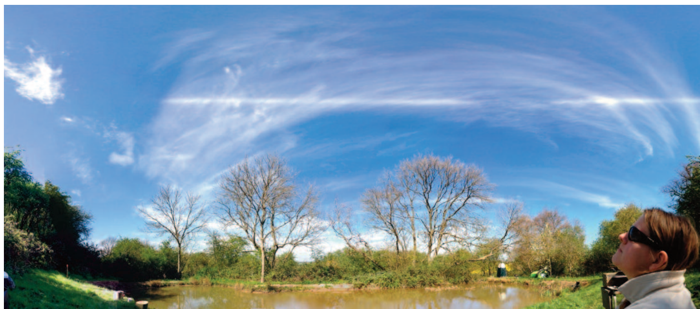
Zatharas Wood

On a happier note, members have been waxing lyrical about their favourite tree species here. Opinions vary, but Lincswood summed it up well, 'For me, it's anything that has been standing for at least a century before I was born, and will still be around for well over a century after I've gone'.