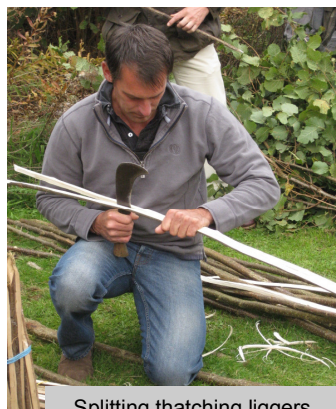
Splitting thatching liggers

The Group toured David's walnut hazel and chestnut orchards.