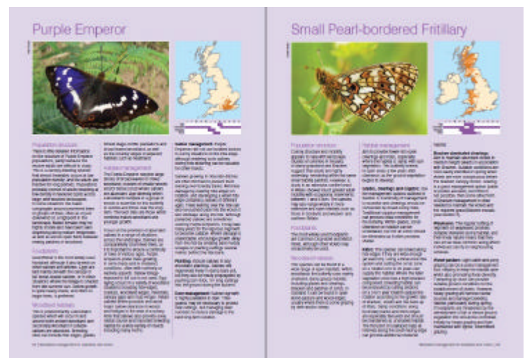
Sample pages from the 62 page, full colour softbound A4 guide