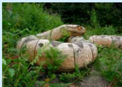
Cinderhill sculpture, 2005

For the last 10 years KHWP has overseen the management of three Local Nature Reserve's, Barnett's Wood, Hilbert Wood and the Crane Valley as well as Cinderhill Community Woodland. The reserves have acted as 'hubs' for much of the conservation and community work KHWP delivers.