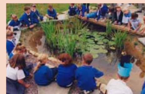
New pond at Sherwood Park School 1998