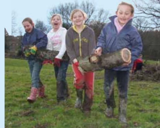
Green Action in progress at Barnett's Wood, 2007