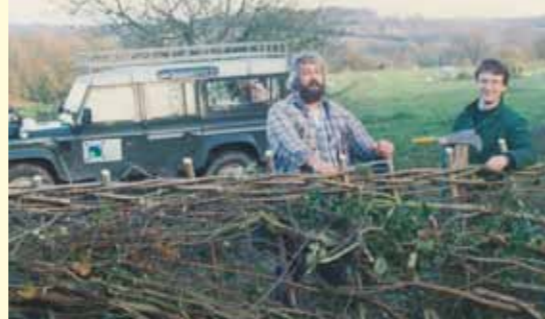
Grant aided laid hedge in Horsmonden 1996