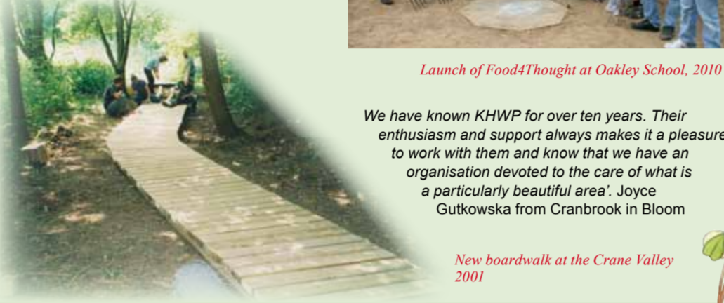
New boardwalk at the Crane Valley 2001