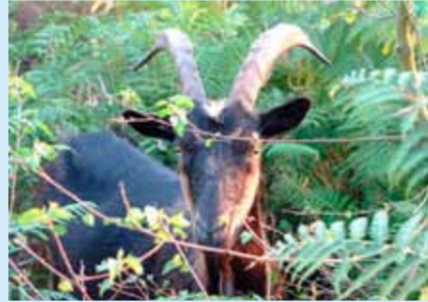
Cinderhill heathland re-creation volunteer! 2003

Our influence and partnership working with other greenspace landowners has remained strong. This has been vital in making greenspaces a better place for wildlife, a more attractive place in which to live and visit and creating a greener future.