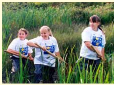
Kent College pupils helping with Pond Week 1997