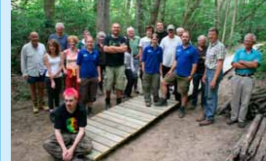
Volunteers carrying out access improvements, 2010

was a big success and it solved a problem that had built up to be a source of complaints from April to September every year: the file was literally bulging with phone messages and complaint letters. Previously, the problem had never really been tackled properly and so it was a great advert for both KHWP and ourselves, especially as it involved the school children and the community.'