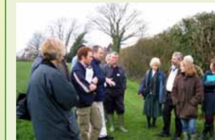
Landowner Workshop 2004