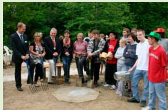
Launch of Food4Thought at Oakley School, 2010

KHWP cannot function in isolation. It is only possible through the commitment, goodwill, trust and integrity of everyone involved in its work. By developing a special role, working in partnership with many differing organisations, bodies, groups or individuals, which are all crucial to this process.