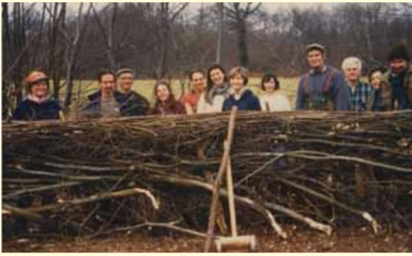
Bokes farm, Hawkhurst, volunteers hedgelaying 1995

In 2010 KHWP was awarded the Investing in Volunteers accreditation. The Standard assesses how an organisation's volunteers are recruited. Achieving the Standard shows prospective volunteers that this is an organisation that knows how to look after its volunteers (plenty of biscuits and tea!)