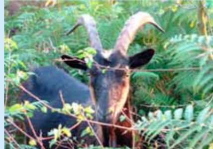
Cinderhill heathland re-creation volunteer! 2003

Our influence and partnership working with other greenspace landowners has remained strong. This has been vital in making greenspaces a better place for wildlife, a more attractive place in which to live and visit and creating a greener future.