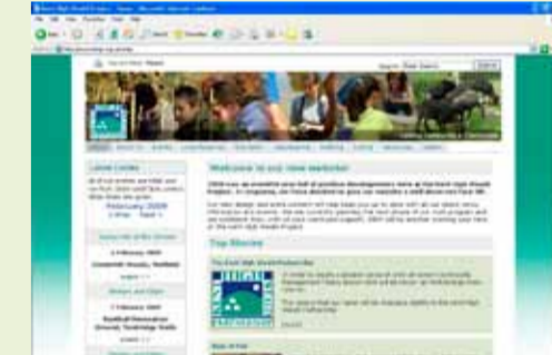
KHWP new website is launched 2009

More recently we have entered cyber conservation! Websites with downloadable resources, video clips, electronic booking systems, audio tours and you can even tweet us!