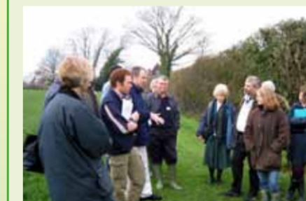
Landowner Workshop 2004