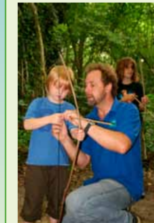
Bow building at Hilbert Woods 2009