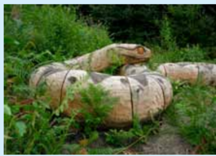
Cinderhill sculpture, 2005

For the last 10 years KHWP has overseen the management of three Local Nature Reserve's, Barnett's Wood, Hilbert Wood and the Crane Valley as well as Cinderhill Community Woodland. The reserves have acted as 'hubs' for much of the conservation and community work KHWP delivers.