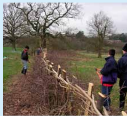
Dunorlan Park, hedge laying 2004