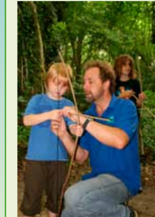
Bow building at Hilbert Woods 2009