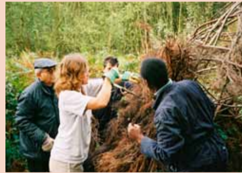
Appledore Project building a Mesolithic shelter, 2004

Volunteer task days have seen a huge variety of people, from incredibly diverse backgrounds, ages and abilities. There reason for volunteering is as diverse as the group itself! But they must love it because they keep coming back!