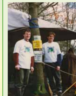
Woodland Craft Day, Angley Wood 1996

More recently we have entered cyber conservation! Websites with downloadable resources, video clips, electronic booking systems, audio tours and you can even tweet us!