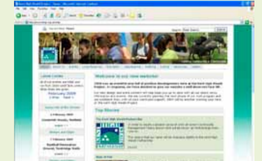
KHWP new website is launched 2009

More recently we have entered cyber conservation! Websites with downloadable resources, video clips, electronic booking systems, audio tours and you can even tweet us!