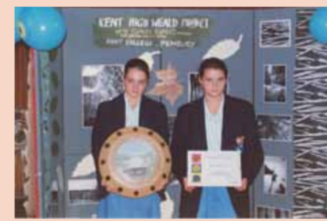
Kent College receiving Green Action Award 1997