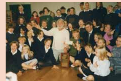
David Bellamy at Broomhill Park School 1996

In 2006 the High Weald Heroes Scheme was launched, which aims to make children more aware of the environment, and specifically the unique local landscape of the High Weald. We have in partnership with the High Weald AONB unit carried out many inspirational projects.