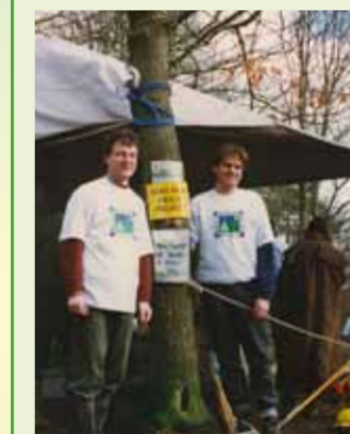
Woodland Craft Day, Angley Wood 1996

More recently we have entered cyber conservation! Websites with downloadable resources, video clips, electronic booking systems, audio tours and you can even tweet us!