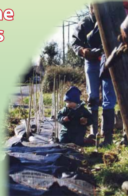
Kildown Mill Green hedge planting, 2000

A huge THANK YOU to all who have contributed towards 20 years of KHWP success, it wouldn't have been possible without you!