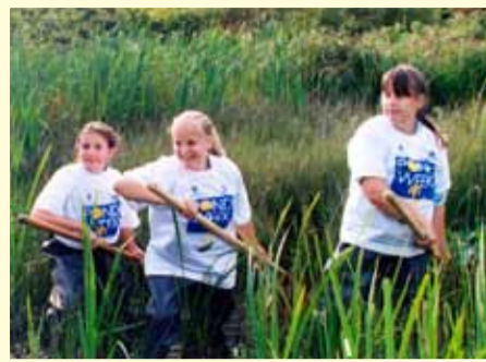
Kent College pupils helping with Pond Week 1997