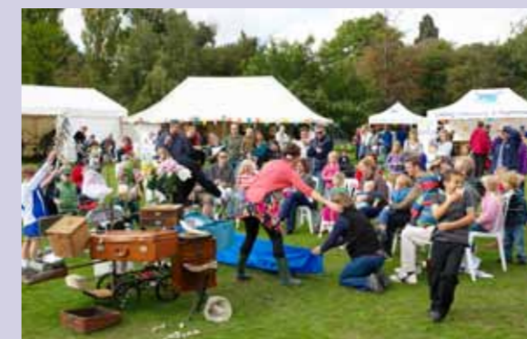
Kent Goes Wild at Dunorlan Park 2010