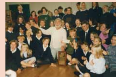
David Bellamy at Broomhill Park School 1996

In 2006 the High Weald Heroes Scheme was launched, which aims to make children more aware of the environment, and specifically the unique local landscape of the High Weald. We have in partnership with the High Weald AONB unit carried out many inspirational projects.