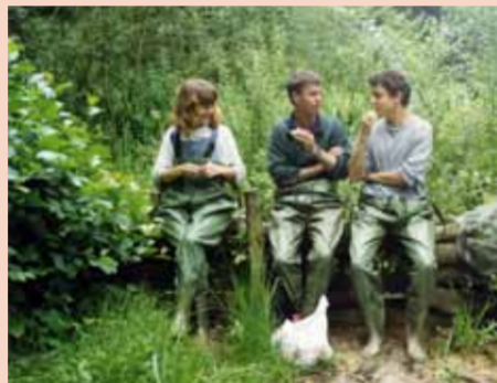
One of the first volunteer tasks at Barnett's Wood, 1992

Practical volunteering has been at the heart of what we do. Countless tasks have taken place over 20 years, covering a dazzling array of projects, places and people. We wouldn't get much done on our own, so the success of these days is entirely down to the fantastic efforts of our volunteers.