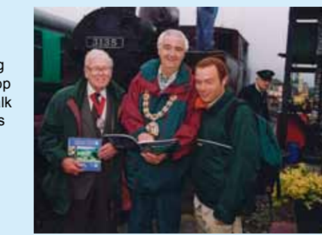
Launch of Tunbridge Wells Circular Walk 2000