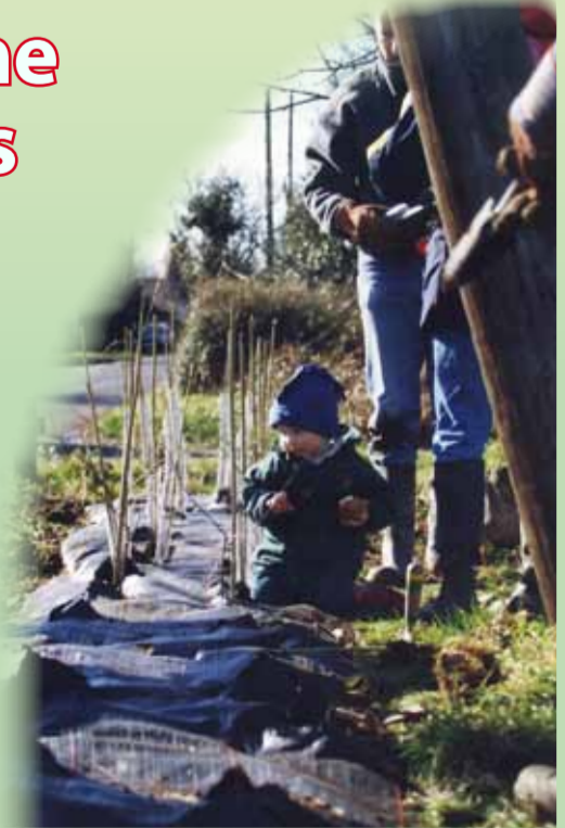
Kildown Mill Green hedge planting, 2000

A huge THANK YOU to all who have contributed towards 20 years of KHWP success, it wouldn't have been possible without you!