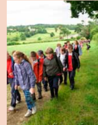
Lamberhurst School on Welly Walk launch 2007