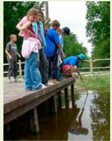
New pond dipping platform at Barnett's Wood 2006

Technology has come along way in 20 years, communication was done mainly via Morse code and semaphores when KHWP began! Events were held in a second-hand scout tent with a certain rustic feel!