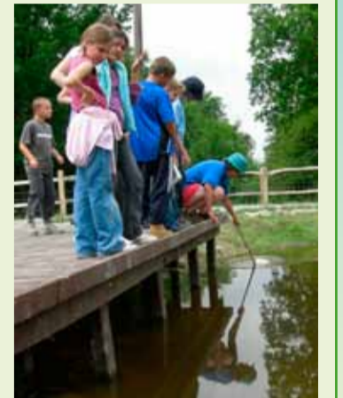
New pond dipping platform at Barnett's Wood 2006