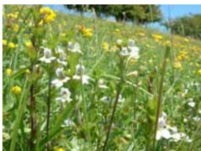
Wildflower Meadow (Sussex Wildlife Trust)

We have a busy field season of surveys and monitoring planned this year to put the wildlife of our area 'on the map', for which we need your help to tell us where some of our conservation-priority species and habitats occur.