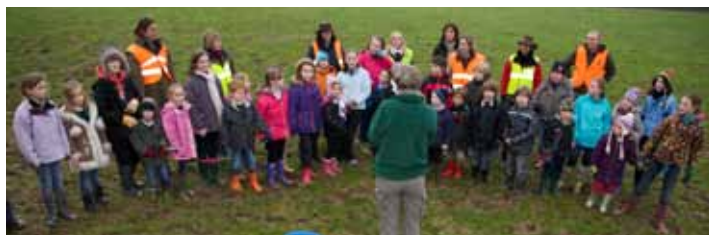
Wisborough Green Primary School hedge-planting at Fishers Farm Park (John Nicholls)

The WWLP has just completed a record-breaking winter planting season to establish new hedgerows, wet woodlands and traditional orchards across the landscape. With generous support from funders – The Tubney Charitable Trust, BBC Wildlife Fund, EDF Energy and Chichester District Council – and working with diverse volunteers and contractors, we have planted: 2000 metres of native hedges on 9 holdings, created 4 new local orchards, and established floodplain trees on 2 farms. We are now working on creating new wetland scrapes and wildflower meadows this year.