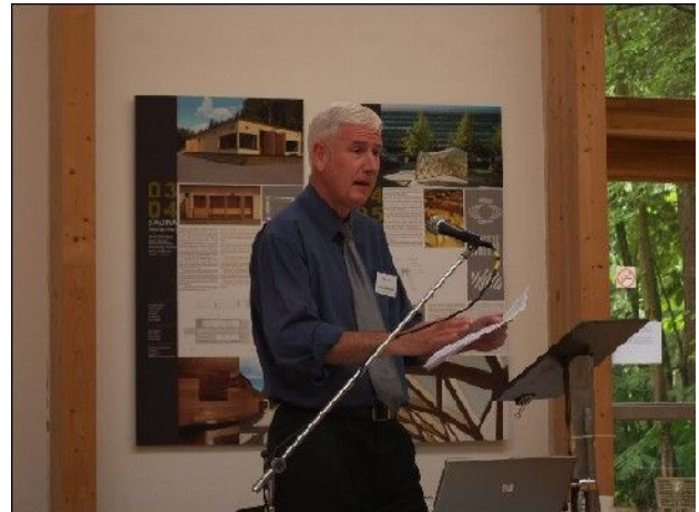
Head of Planning and Development